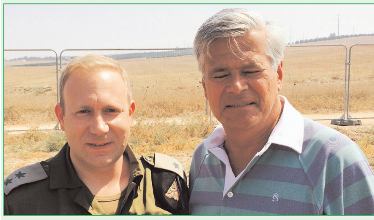
(Left): Cuomo tours a tunnel in Nahal Oz (Above): Skelos with an Israeli commander. (Right): Silver and Cuomo meet a soldier near Big Apple Pizza.

During our visit to the Iron Dome battery, and also during a tour of a Hamas-built infiltration tunnel, our delegation was within only a mile or New York and the tri-state area, but more so the two of the Gaza border, and we were told that if a missile was released, shared values, morals and democratic principles we would have to get out of the bus and lie on the ground.